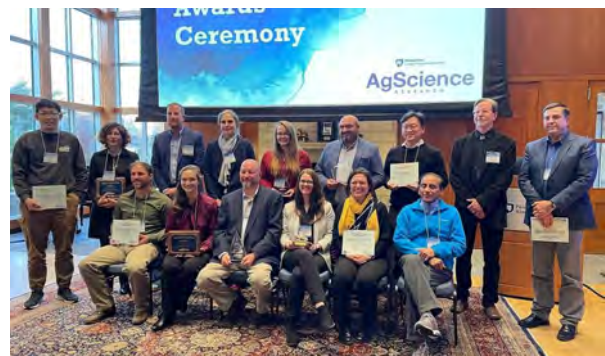
Penn State Research Award Ceremony hosted by the College of Agricultural Sciences.