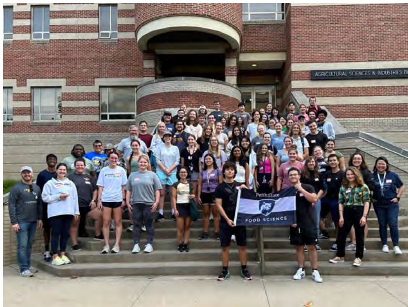
Penn State Food Science Club